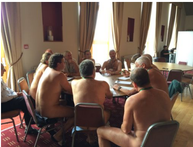
A working group discussing problems and solutions relating to censorship of naturism during the INF Congress.